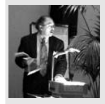
Everyone at some point can be the teacher, the student and the leader. But who knows when?

The magazine of the Association of California School Administrators focused on this sort of approach about a year ago. They talked about schools as personalised communities' – not individualised communities, interestingly.