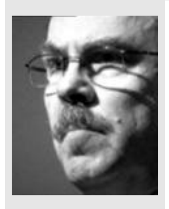
... schools with a high degree of 'relational trust' are more likely to make the kinds of change that help raise student achievement.